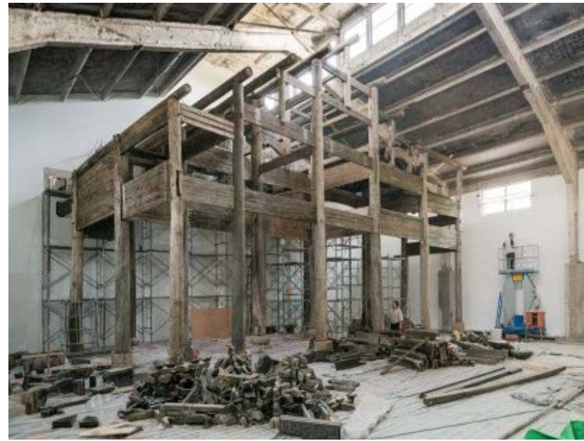
A replica Anhui-style house, an embodiment of local customs, community, and society