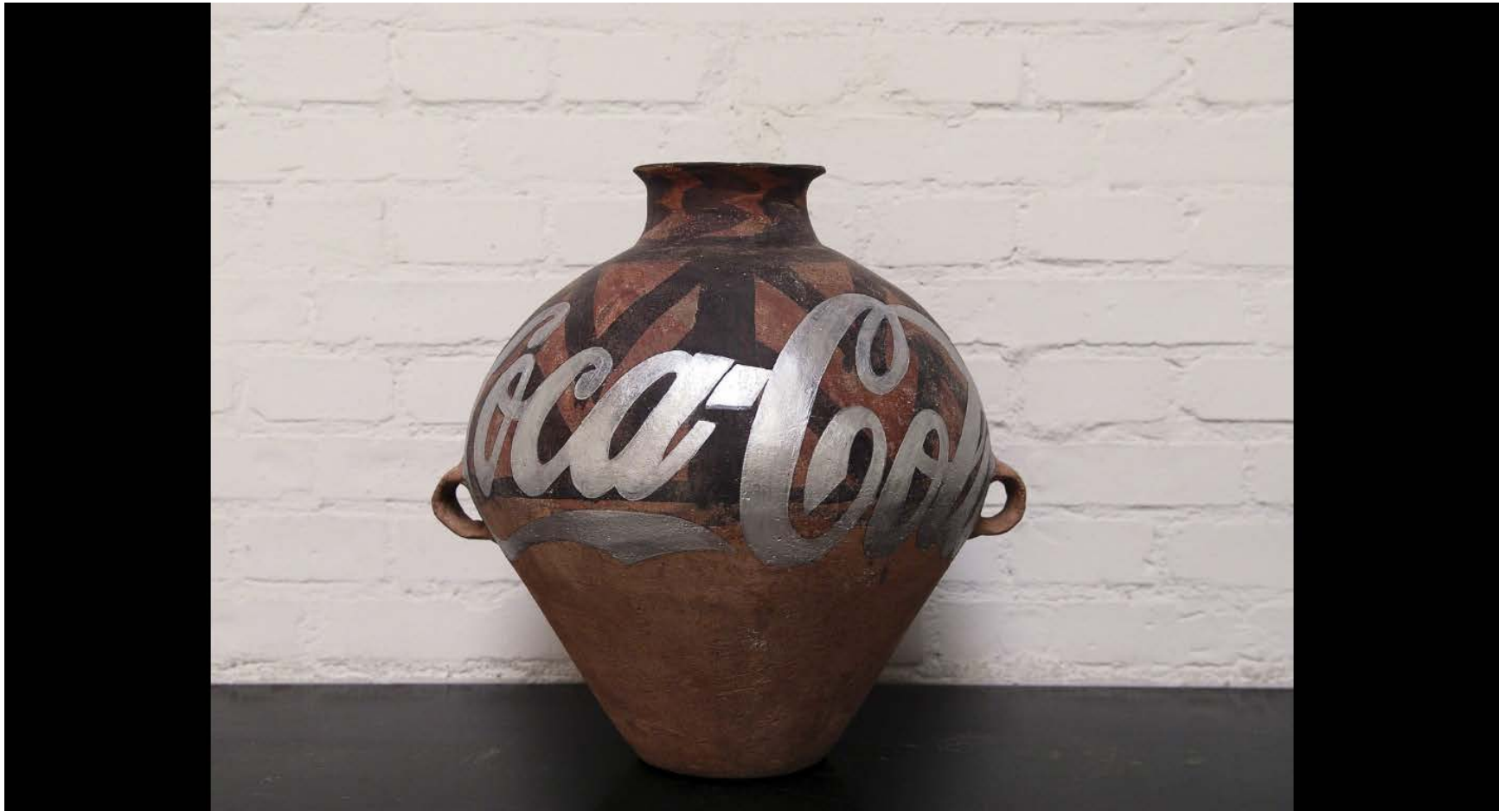
“Han Dynasty Urn with Coca Cola logo” [silver] 2007