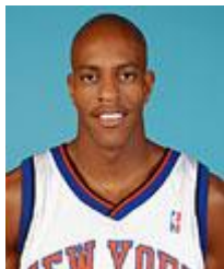
Jerome Vernon Williams - Basketball Years attended MC - 1992-94

Jerome Williams is in his ninth season of professional basketball, having moved to the New York Knicks this year from the Chicago Bulls and, earlier, the Toronto Raptors. As a point guard with Montgomery College teams, he averaged 23 points and 17 rebounds per game, and he took statewide MVP honors in his sophomore year. In his rookie season with the Detroit Pistons, he earned the nickname Junk Yard Dog—a moniker he now uses to promote community outreach projects in Chicago and Toronto aimed at inspiring young people to excel in academics and develop their self-confidence. Also, while in Detroit, he founded Positive Shades of Black, to place educational incentive programs in local schools.